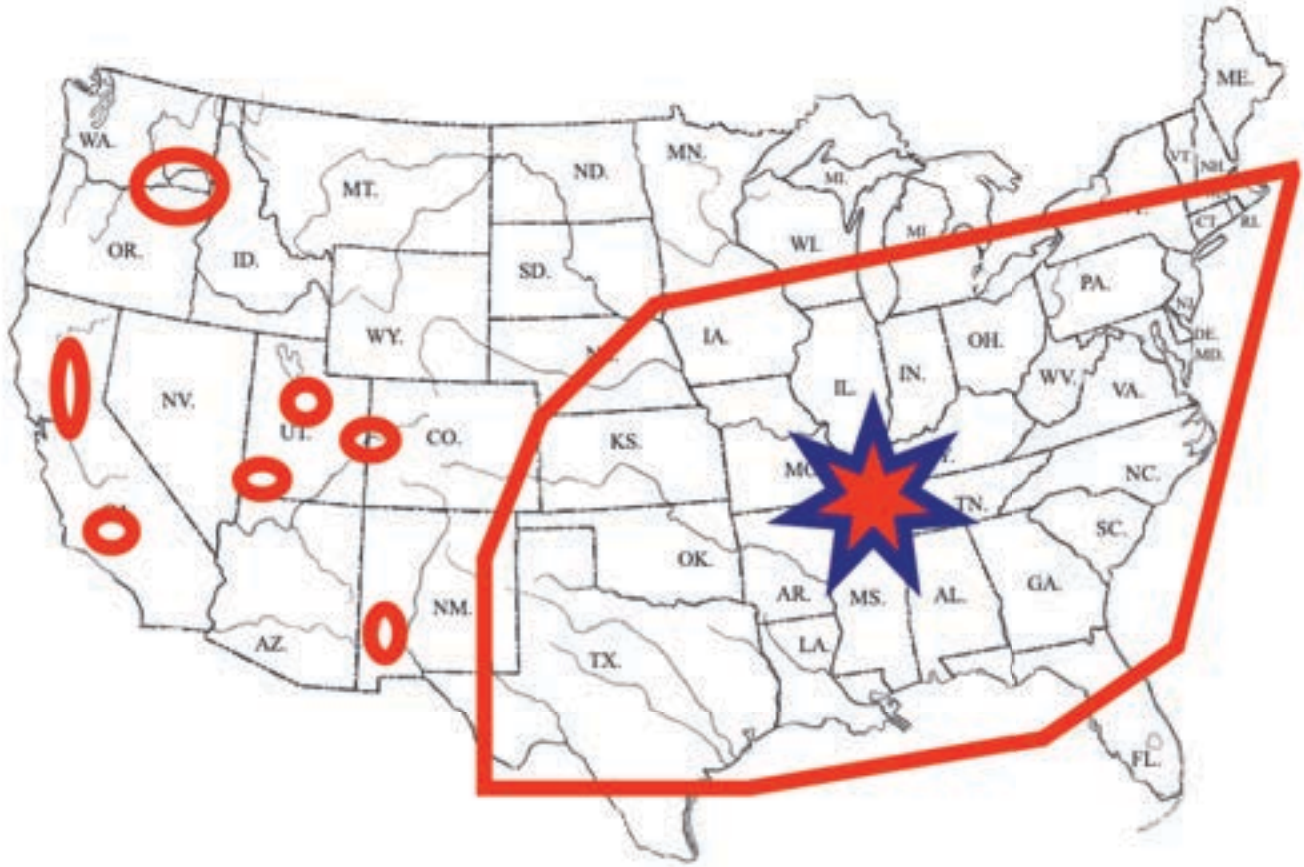
Figure 2: Naturalized range and pockets of Maclura pomifera - Osage-orange in ~38 states and one province. (USDA-NRSC PLANTS database)