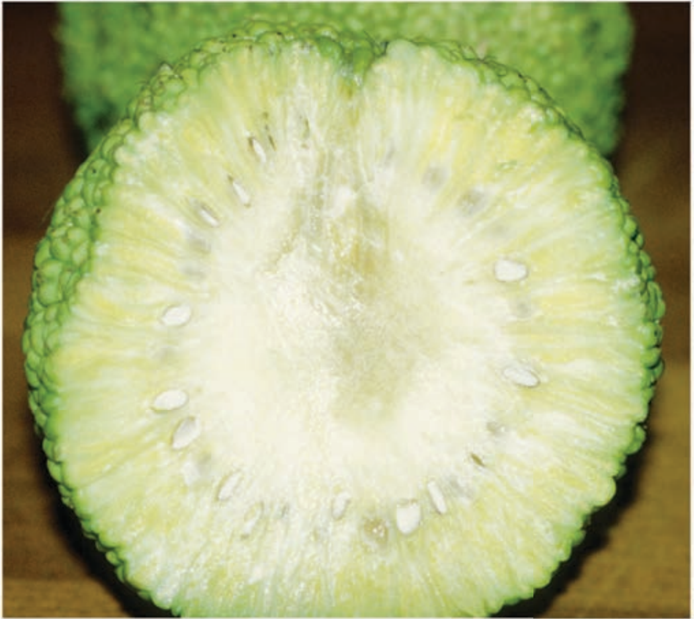
Figure 6: Osage-orange fruit cut in half showing seeds. Fruit taken from area with both male and female trees.