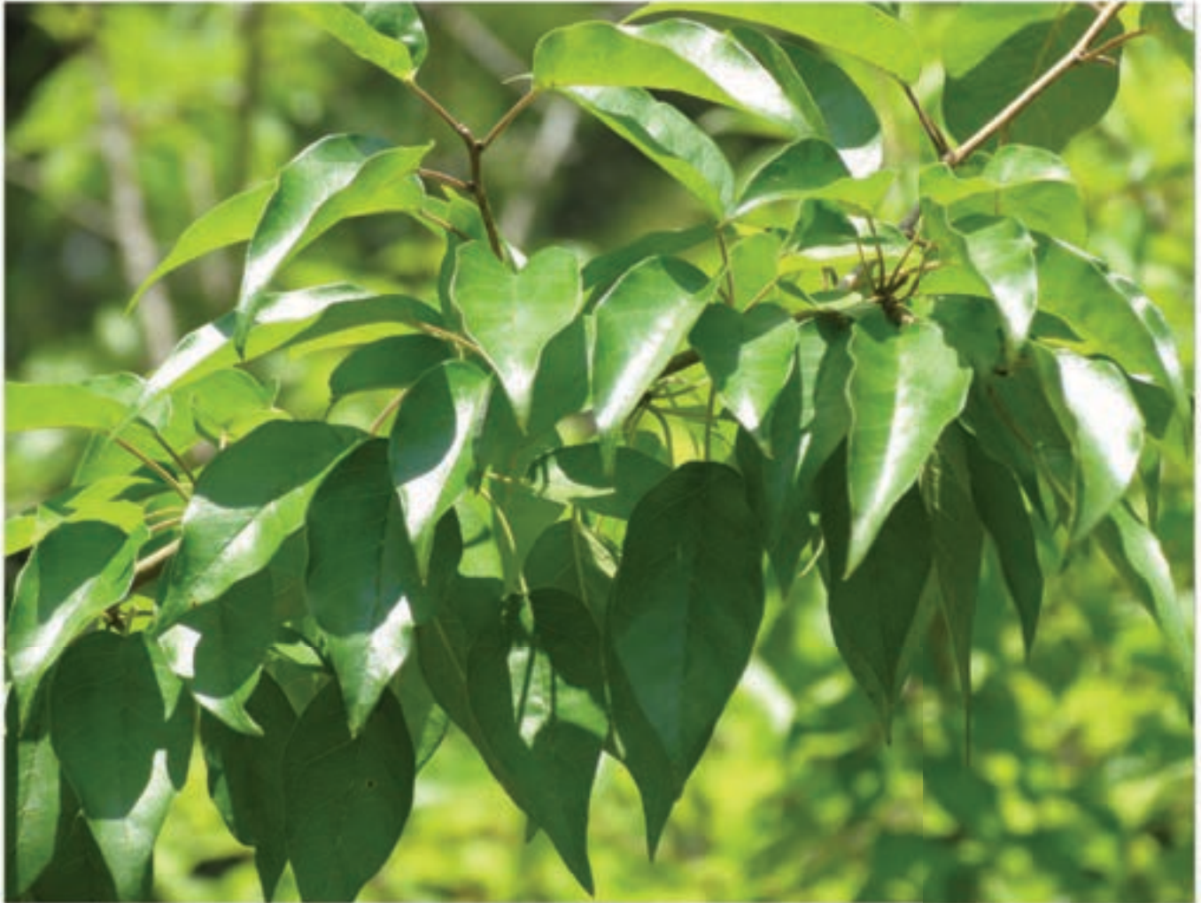
Figure 3: Osage-orange leaves.