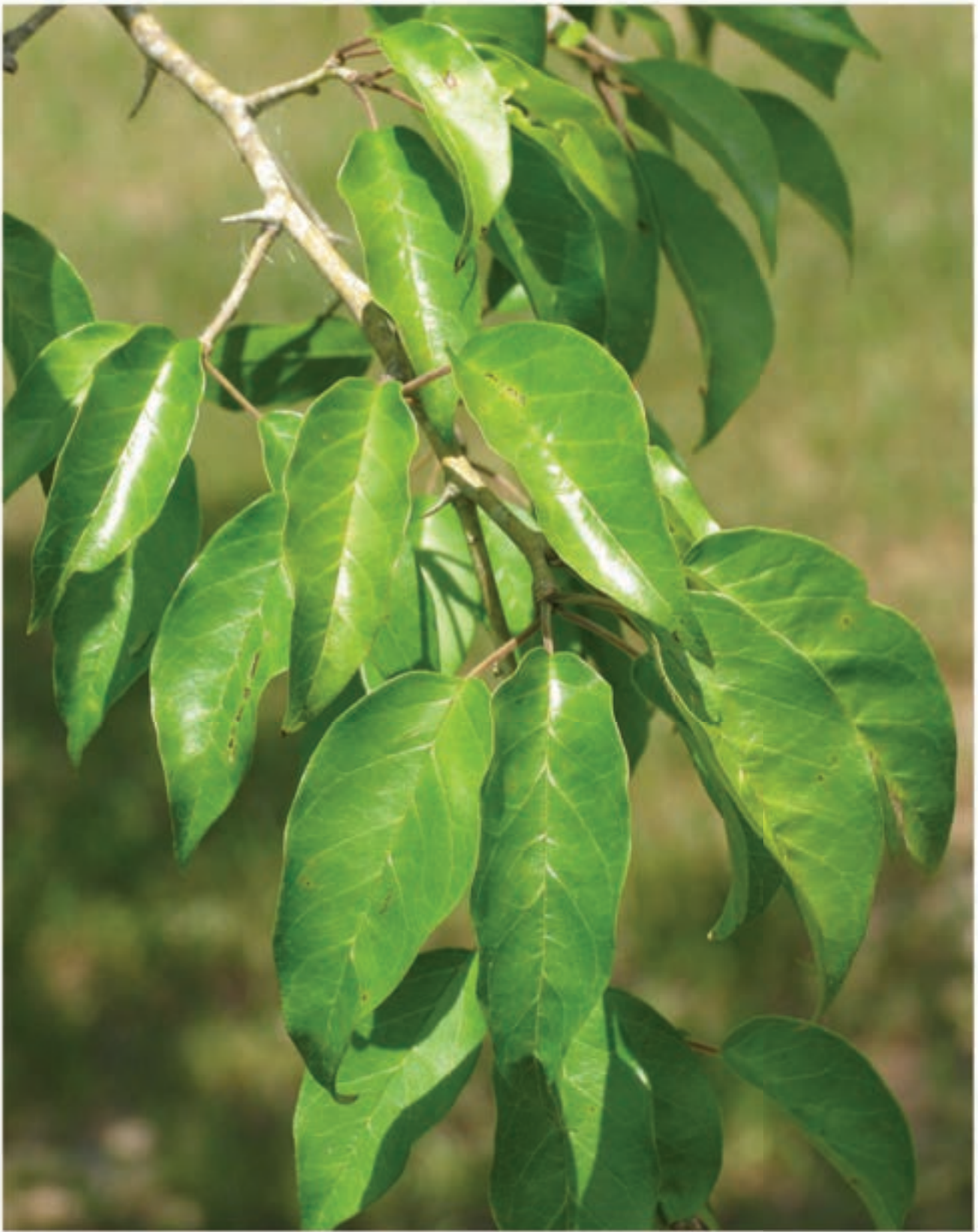
Figure 4: Osage-orange leaves, zig-zag twig form, and thorns.