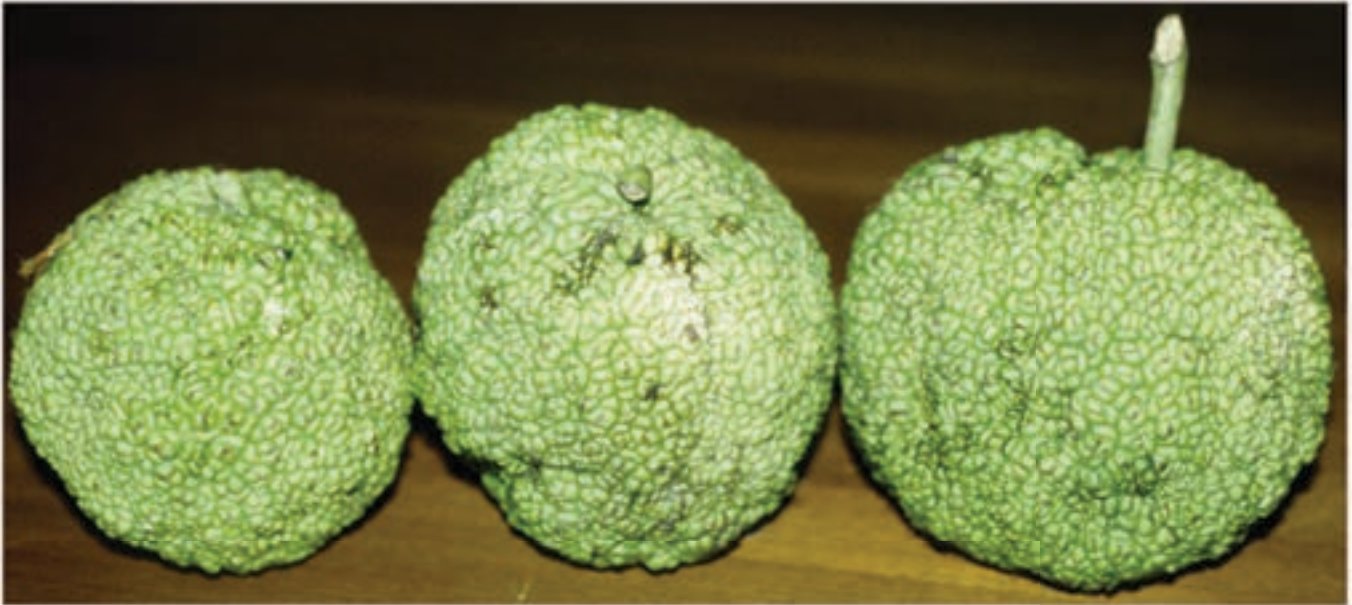
Figure 5: Osage-orange fruit showing shape and size variation. Fruit taken from area with both male and female trees.